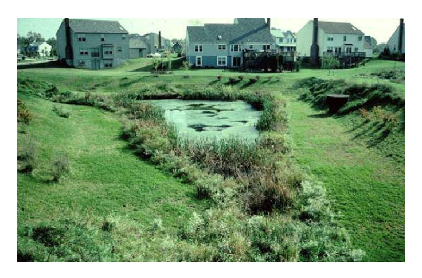
SECTION 1: DESCRIPTION

An Extended Detention (ED) Pond relies on 12 to 24 hour detention of stormwater runoff after each rain event. An under-sized outlet structure restricts stormwater flow so it backs up and is stored within the basin. The temporary ponding enables particulate pollutants to settle out and reduces the maximum peak discharge to the downstream channel, thereby reducing the effective shear stress on banks of the receiving stream. ED differs from stormwater detention, since it is designed to achieve a minimum drawdown time, rather than a maximum peak rate of flow (which is commonly used to design for peak discharge or flood control purposes and often detains flows for just a few minutes or hours). However, detention used for channel protection, may result in extended drawdown times. Therefore, designers are encouraged to evaluate the detention drawdown as compared to the ED requirements in order to meet both criteria. ED ponds rely on gravitational settling as their primary pollutant removal mechanism. Consequently, they generally provide fair-to-good removal for particulate pollutants, but low or negligible removal for soluble pollutants, such as nitrate and soluble phosphorus. The use of ED alone generally results in the lowest overall pollutant removal rate of any single stormwater treatment option. As a result, ED is normally combined with wet ponds (Design Specification No 14) or constructed wetlands (Design Specification No 15) to maximize pollutant removal rates.